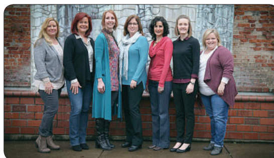
The Hope Connection