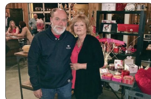
Rain Dance Vineyards