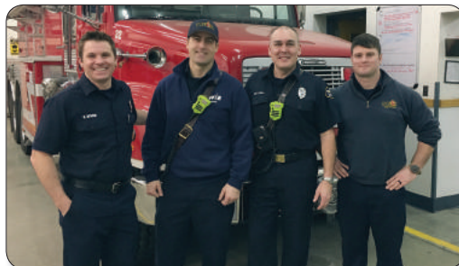
Newberg Fire/Tualatin Valley Fire & Rescue Department