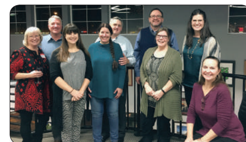
Bella Casa Real Estate Group