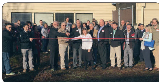
Chehalem Valley Innovation Accelerator