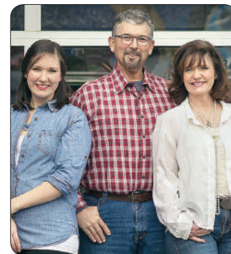
2016 Volunteer Organization of the Year A Family Place