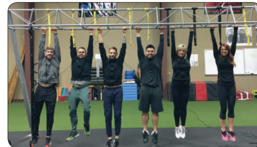
Impact Performance Training